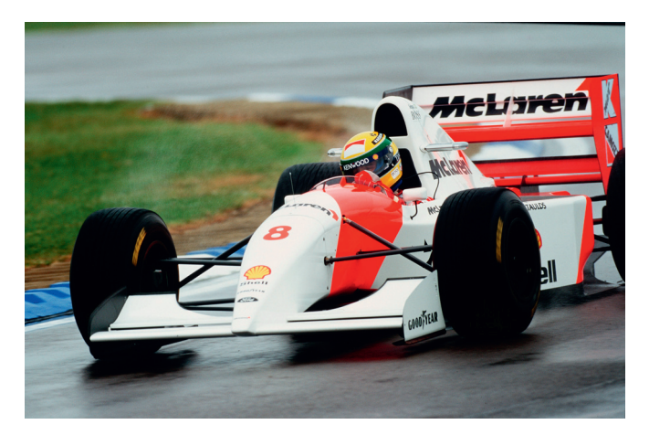
Figure 4 Substitution of Marlboro with McLaren on a McLaren F1 car in 1993.

occasionally even during the season. Furthermore, if it was a case of advertising branding, Philip Morris would have to own a legal copyright on it'. <sup>59</sup> An article on a motorsport website (http://www.autosport.com/) quoted from a Scuderia Ferrari Marlboro press release, which said that criticism was 'based on two suppositions: that part of the graphics featured on the Formula 1 cars are reminiscent of the Marlboro logo and even that the red colour which is a traditional feature of our cars is a form of tobacco publicity...neither of these arguments have any scientific basis, as they rely on some alleged studies which have never been published in academic journals. But more importantly, they do not correspond to the truth'. <sup>60</sup>