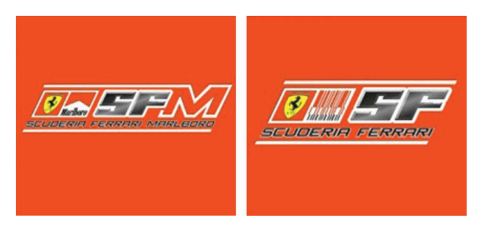
Figure 2 Ferrari F1 team names and logos, 2007 and 2010.

livery. This was to promote Philip Morris' new Marlboro Lights brand of cigarettes. The colour did not work on television and the experiment was never repeated.<sup>33</sup>