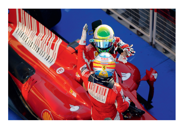
Figure 7 Marlboro 'barcodes' on both the Ferrari race car and the driver's clothing in early 2010.

techniques known as 'trademark diversification' and 'alibi marketing'. <sup>61</sup> Trademark diversification involves the use of a cigarette brand name on the branding of other and typically unrelated products, such as clothing. <sup>62</sup> Alibi marketing involves distilling a brand identity into its key components, such as the distinctive red and white colouring associated with the Marlboro brand, or the shade of purple used by Silk Cut, and using these to promote the brand in place of a conventional logo or trademark. <sup>63</sup> This study was carried out to assess the validity of Ferrari's assertion that barcode design displayed on their F1