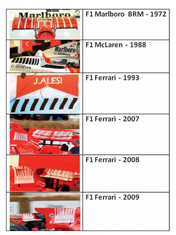
Figure 6 The evolution of the Marlboro barcode.

techniques known as 'trademark diversification' and 'alibi marketing'. <sup>61</sup> Trademark diversification involves the use of a cigarette brand name on the branding of other and typically unrelated products, such as clothing. <sup>62</sup> Alibi marketing involves distilling a brand identity into its key components, such as the distinctive red and white colouring associated with the Marlboro brand, or the shade of purple used by Silk Cut, and using these to promote the brand in place of a conventional logo or trademark. <sup>63</sup> This study was carried out to assess the validity of Ferrari's assertion that barcode design displayed on their F1