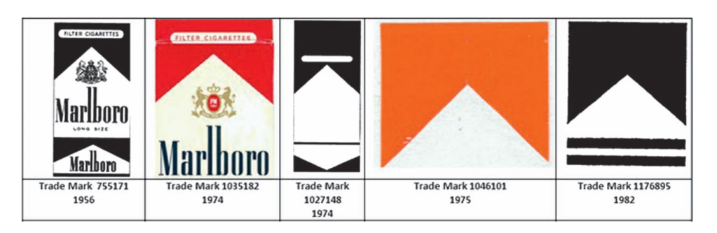
Figure 3 A selection of Philip Morris trademarks registered in the UK 1956—82.

When challenged by a series of media reports in early 2010 that the barcode design was in reality a Marlboro logo, Ferrari responded that 'the so called barcode is an integral part of the livery of the car and of all images coordinated by the Scuderia, as can be seen from the fact it is modified every year, and,