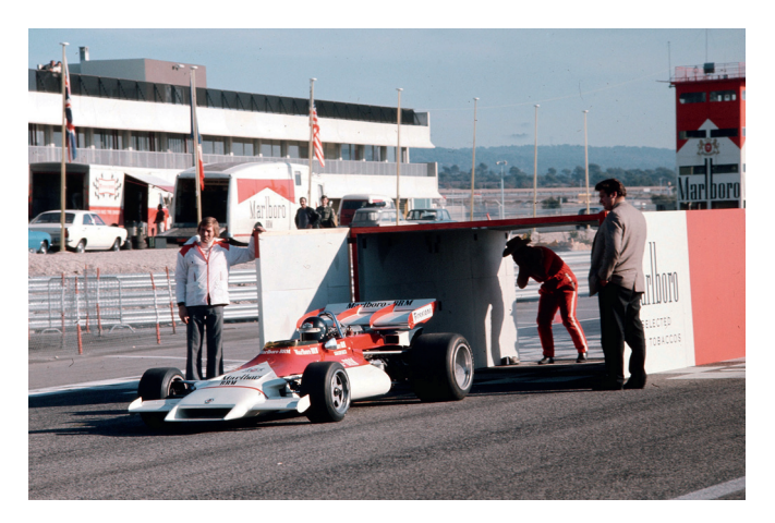
Figure 1 Marlboro branded BRM F1 car emerging from a mock-up of a giant Marlboro cigarette pack in 1972.

The Ferrari F1 team traditionally races in Italy's historic national motor racing colour, red. Philip Morris documents reveal that the company has long recognised the importance of association with Ferrari, and the red colour schemes shared by Ferrari and the Marlboro brand. Only once in F1 has Marlboro made use of a colour other than red, at the 1986 Portuguese F1 Grand Prix, when McLaren ran one car in a gold and white