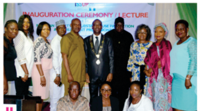
Attendees at the Inauguration Ceremony