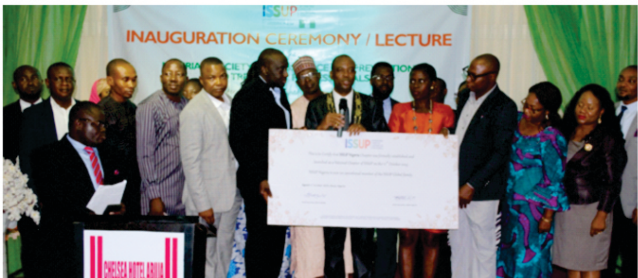
ISSUP Nigeria Chapter Executives