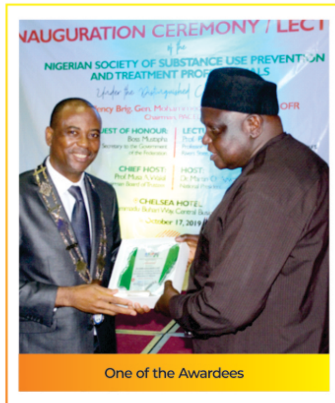
One of the Awardees

He charged the Nigerian Society of Substance Use Prevention and Treatment Professionals (ISSUP Nigeria) to advice and work with the government to establish drug demand reduction regulatory body to supervise and regulate the practice of drug demand reduction in Nigeria. Beyond that, such body should be given legislative teeth to bite appropriately, while visible coordination activates should be