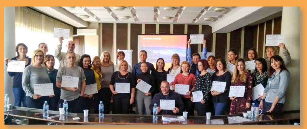
Implementation of UTC training workshop in Serbia