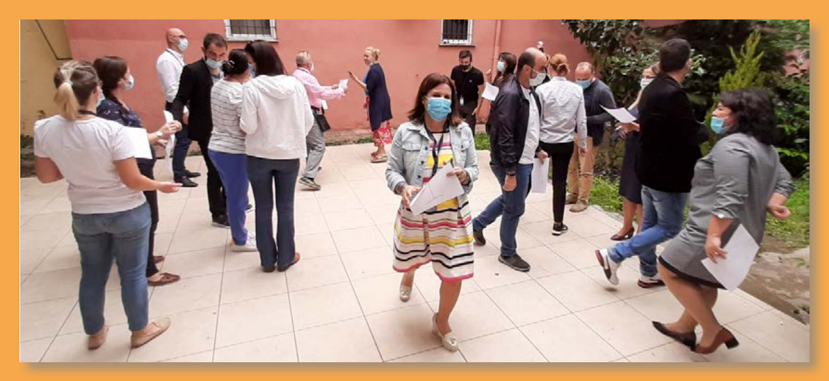
Implementation of UTC training workshop in Albania