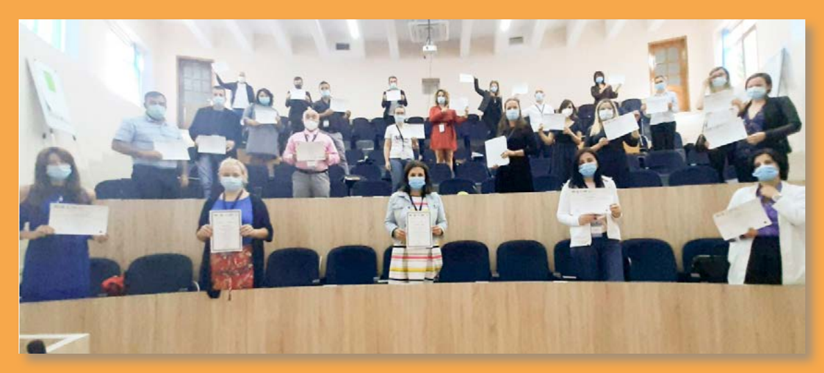
Implementation of UTC training workshop in Albania