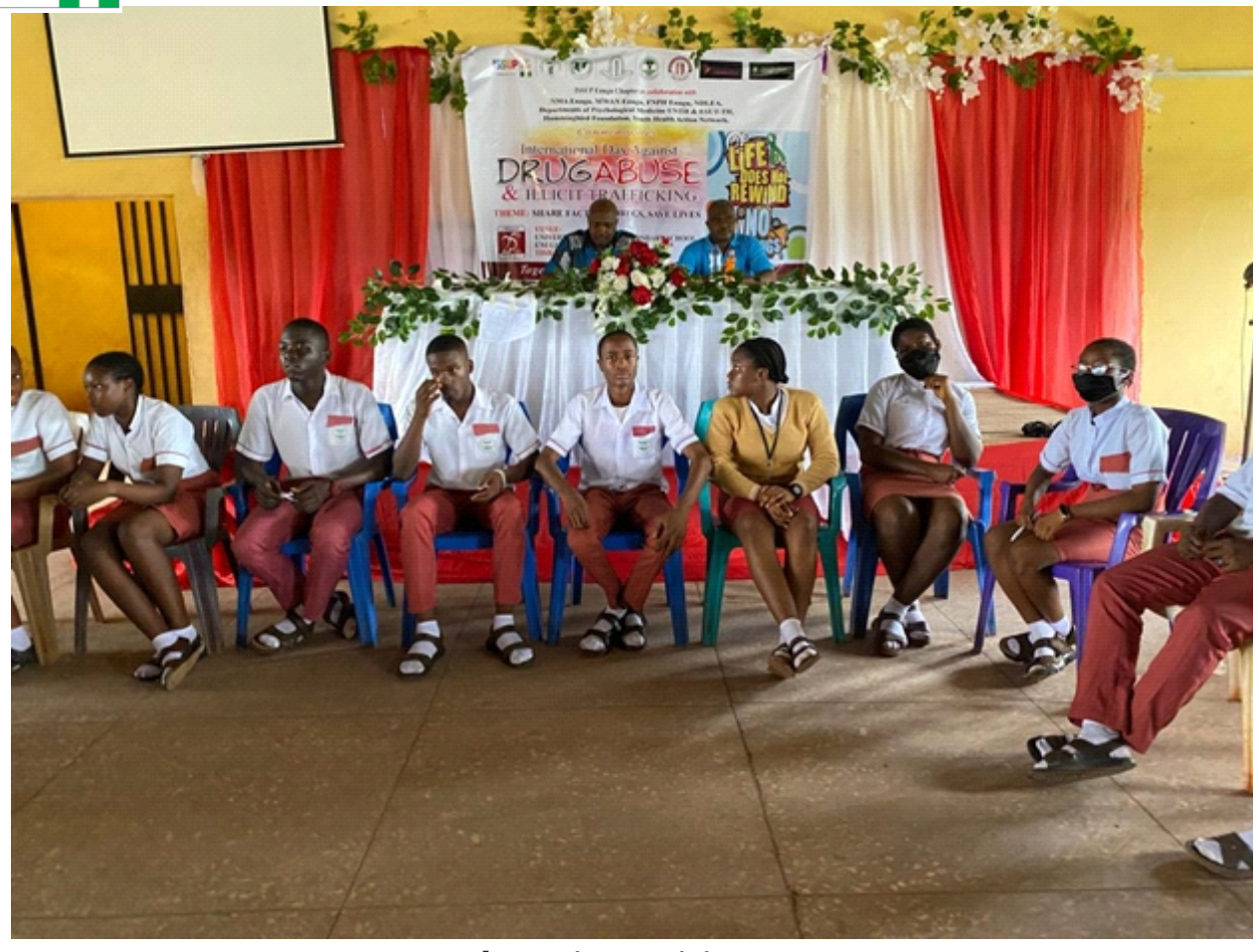
The quiz participants