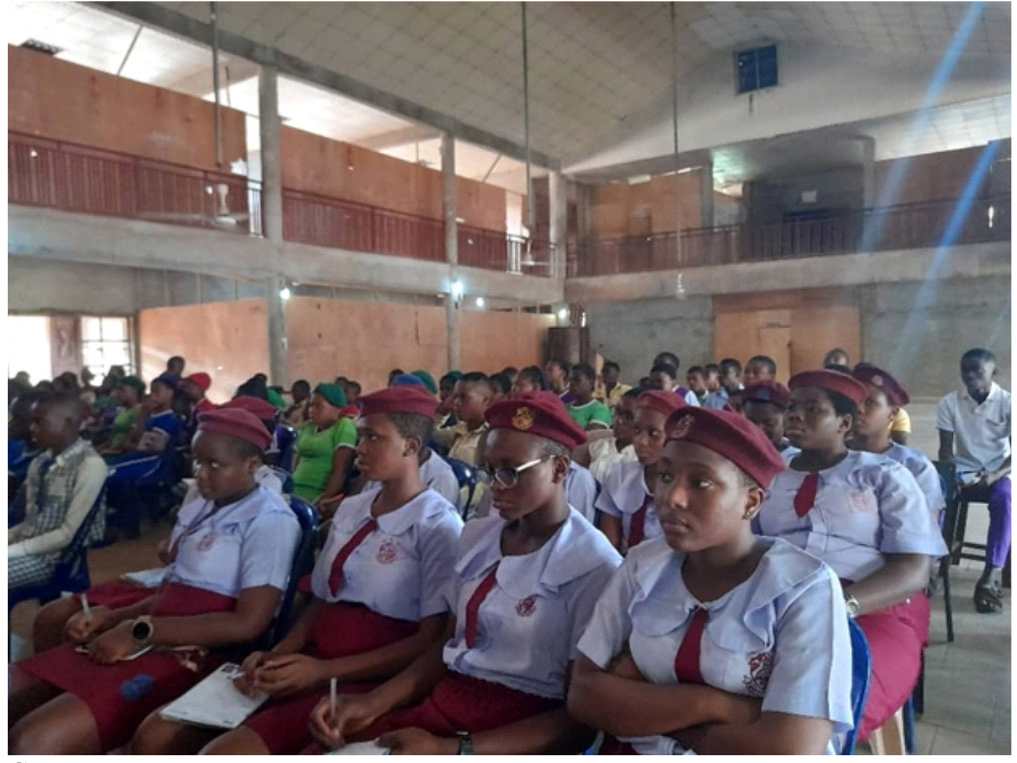
Students at the events