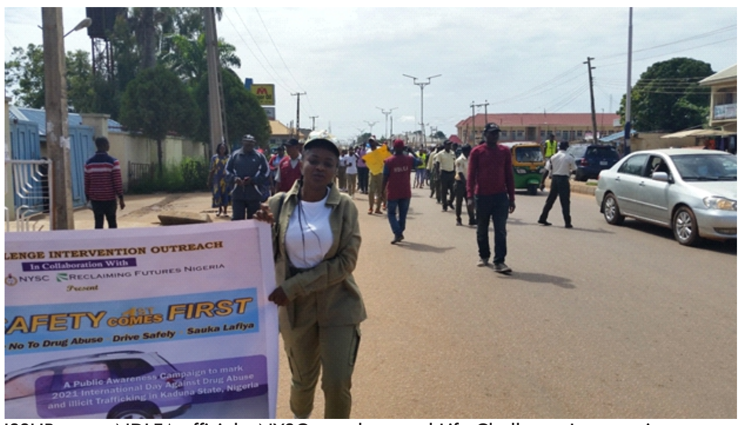
ISSUP team, NDLEA officials, NYSC members and Life Challenge Intervention Outreach walk