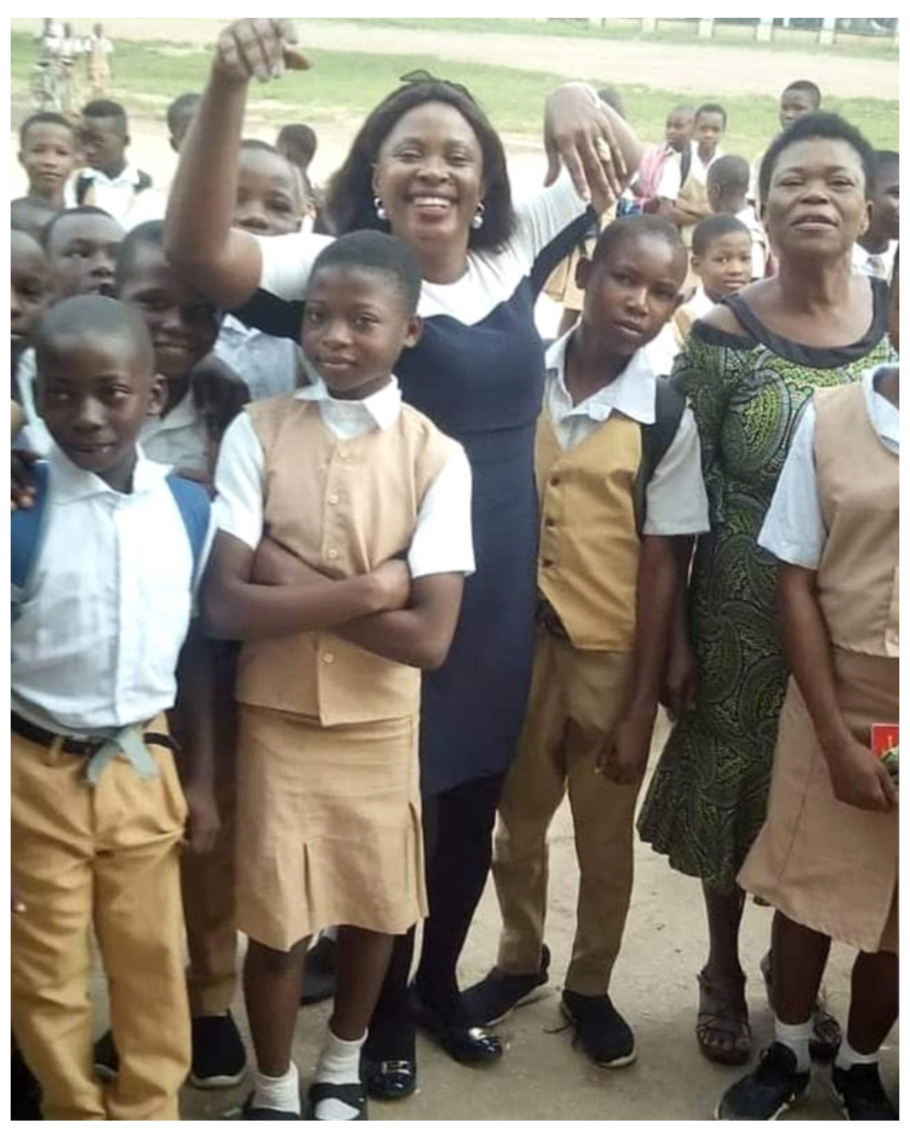
At one of the students' events