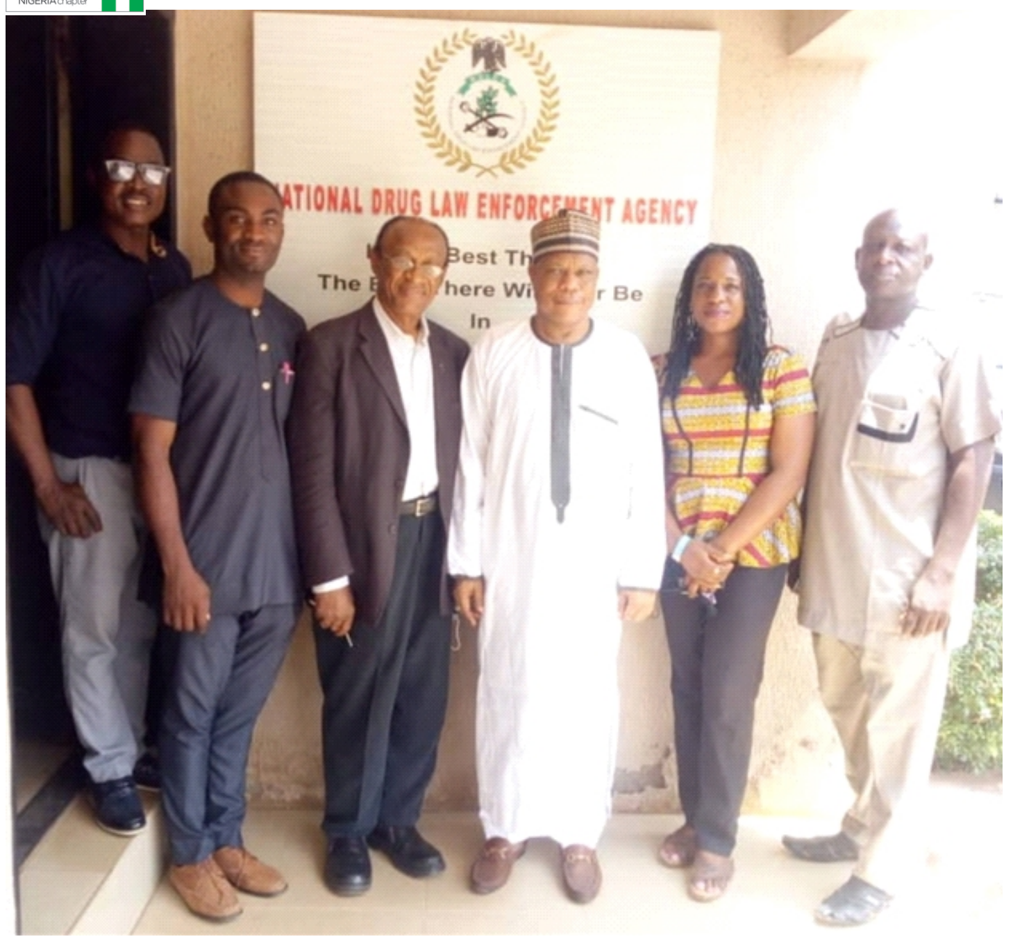
Anambra State ISSUP team with the NDLEA State Commander