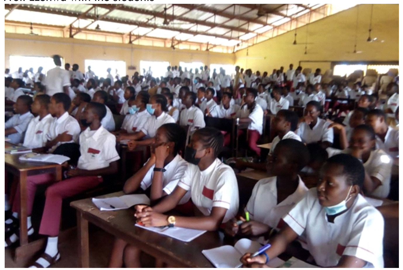
Students at the session