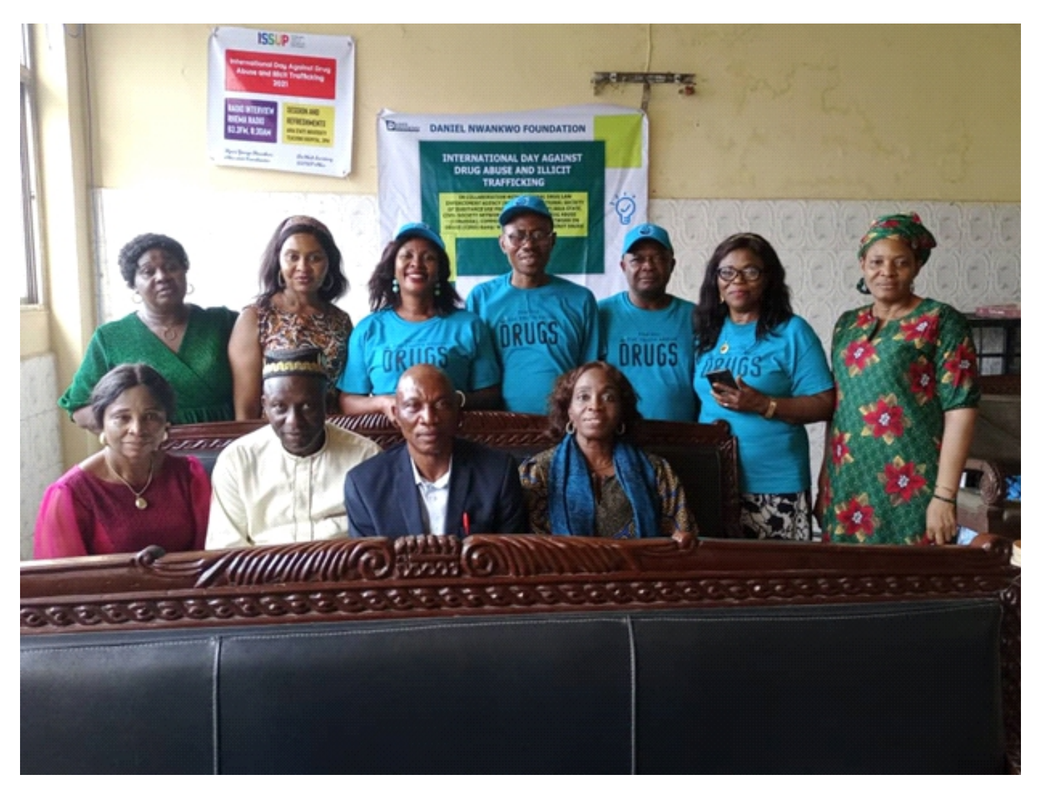
Abia state ISSUP Team with dignitaries

In addition, a gala meeting was held at the Abia state University Teaching Hospital to review activities of the state branch as well as membership drive. The commemoration ended in the state with two separate church services.