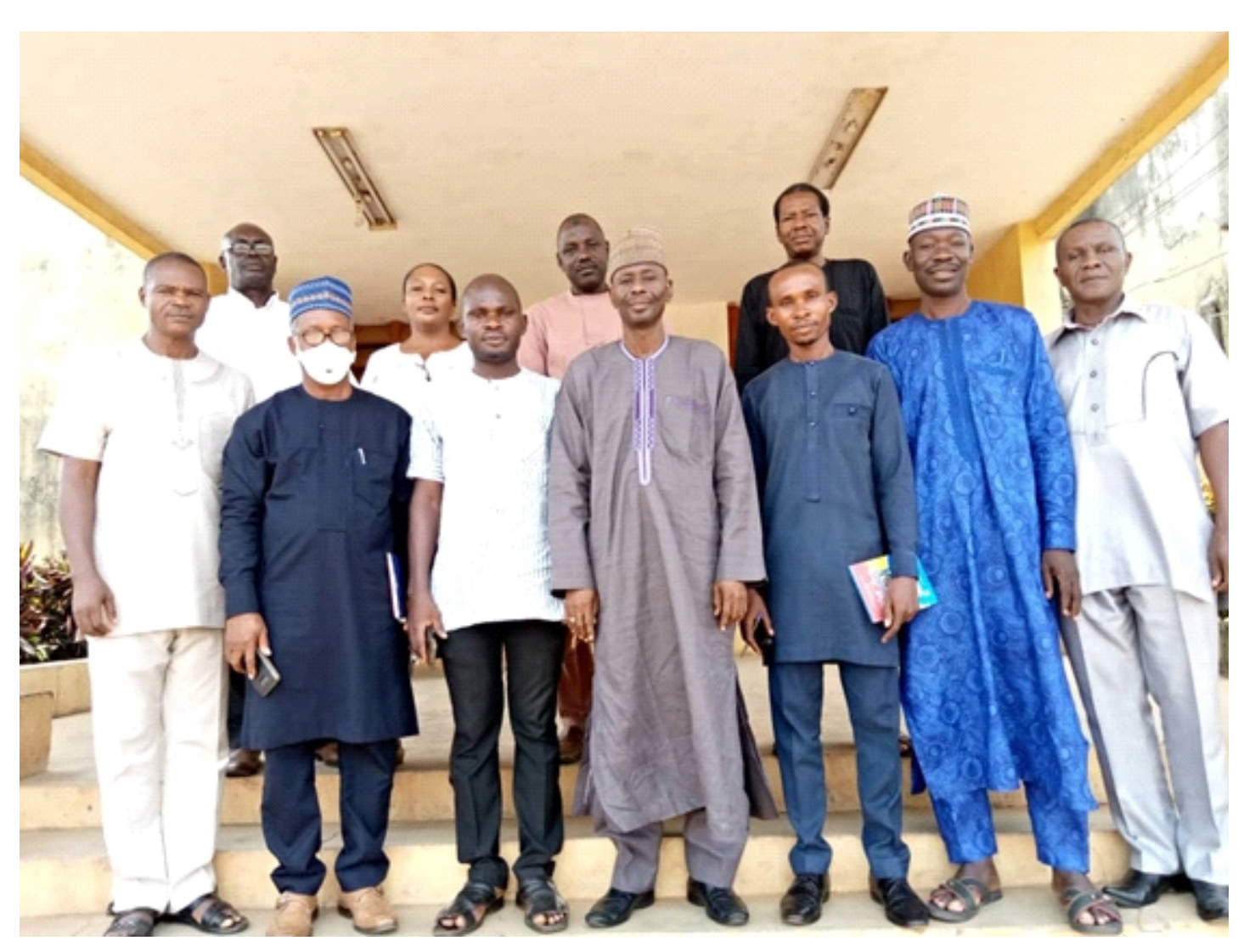
The NDLEA state Commander at the middle and ISSUP state coordinator 3rd from right

Furthermore, the Commander hinted on the proposed state-wide drug abuse sensitisation being planned by the State Government that will involve various stakeholders, including the Local Government Chairmen, Traditional Rulers, religious leaders, and others. He urged ISSUP to participate as collaborators and as an integrated part of the NDLEA DDR section. On behalf of ISSUP, the state coordinator expressed appreciation to the Commander for his warm reception and emphasized the importance of having NDLEA staff as members of ISSUP.