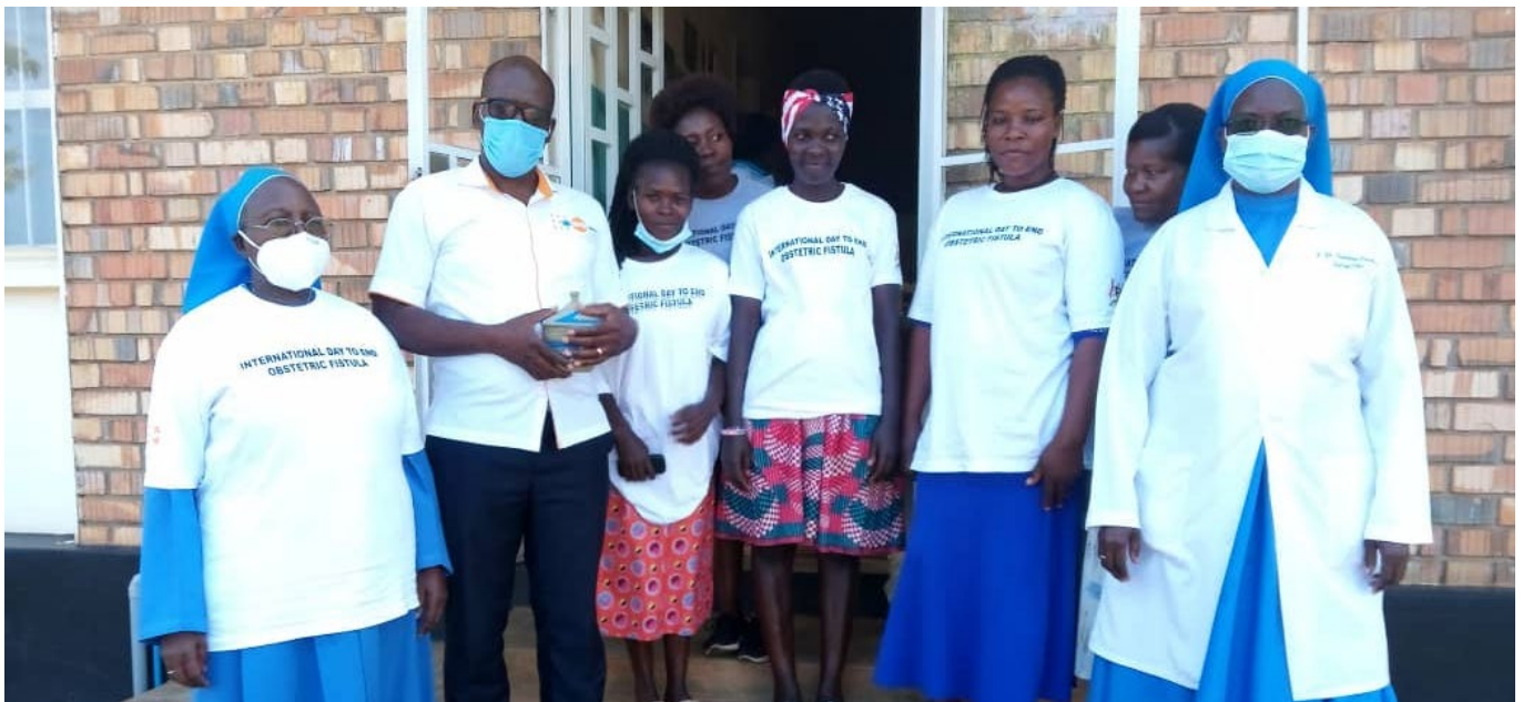
Fistula survivors pose for a photo with surgeons outside the recovery ward at Kitovu Mission hospital, Masaka