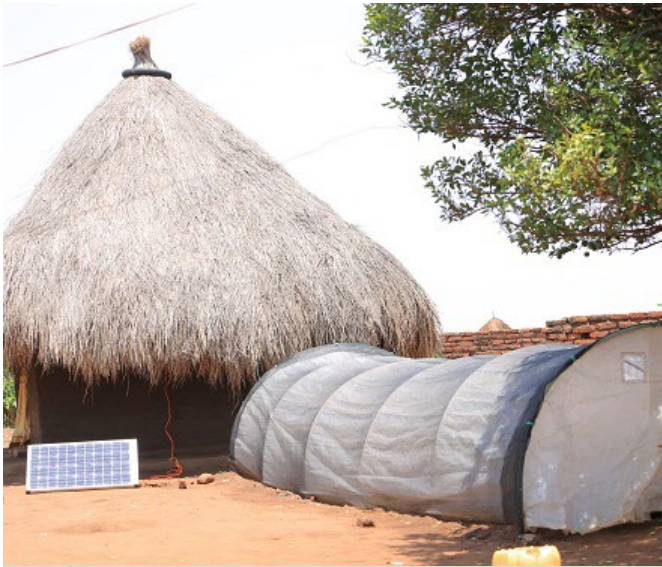
The solar powered irrigation system pump which has over 80 sprinkler points, distributing water at 360 degrees across the planted area @ FAO Uganda

By Agatha Ayebazibwe, Food and Agriculture Organization (FAO)