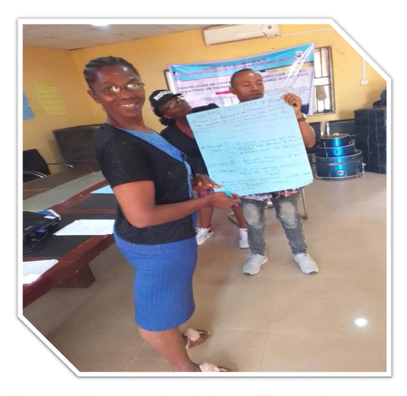
Group work presentation during training session