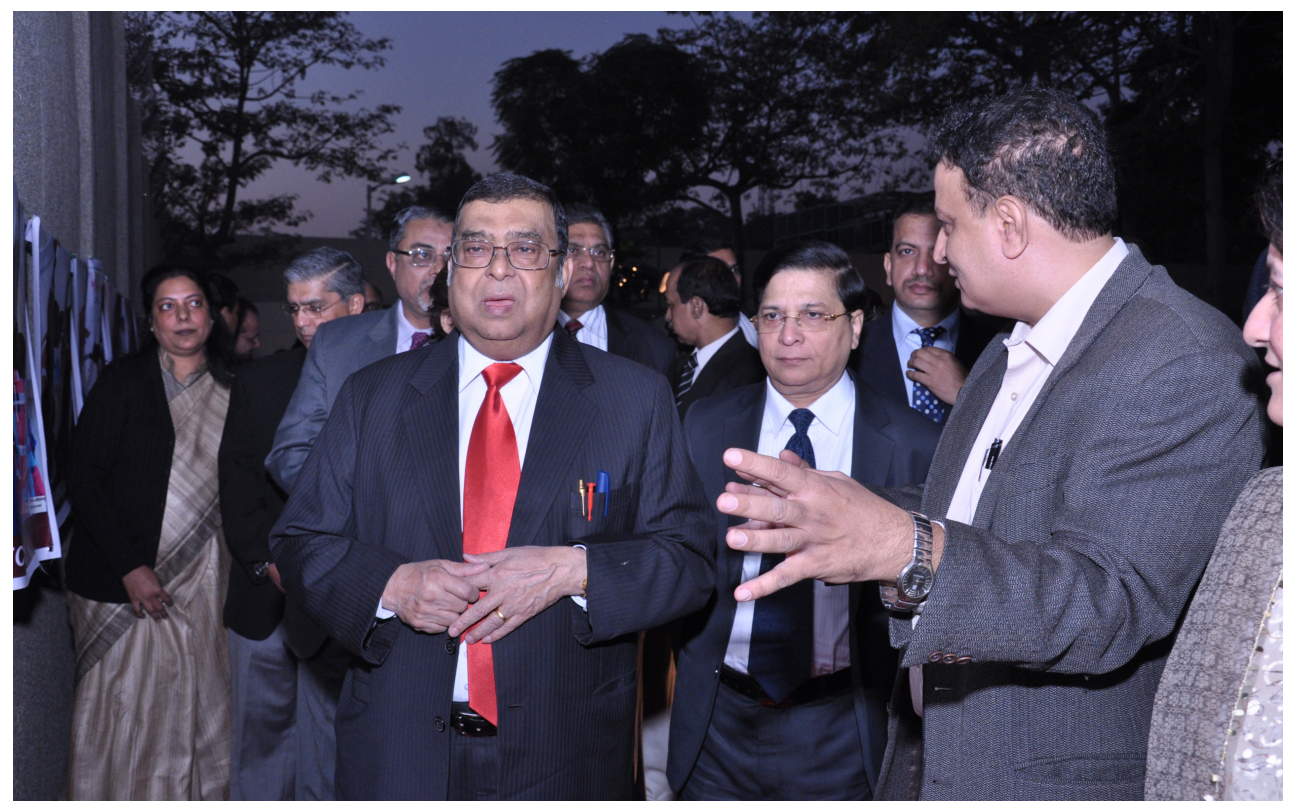
Visit to JDRC by Shri Altamas Kabir Hon'ble Chief Justice of India , Mr Justice Dipak Misra Chief Justice of the hon'ble High Court of Delhi and Ms Mukta Gupta sitting Judge of the Hon'ble Delhi High Court

SPYM manages and operates the program to reform and rehabilitate juveniles in conflict with the law and drug dependency, in partnership with the Department of Women and Child Development, Govt. of National Capital Territory of Delhi at Deaddiction cum Rehabilitation Centre for Juveniles in Conflict with Law. The centre is the first initiative in India to work with this specific target group.