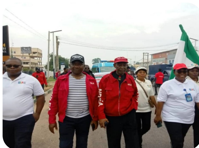
Kaduna State ISSUP Coordinator, The Kaduna State NDLEA Commander, The Director of Narcotics, KD State, The Secretary General & Kaduna State ISSUP Secretary and some Members of ISSUP, Kaduna on Road walk in Commemoration of International Day against Drug Abuse