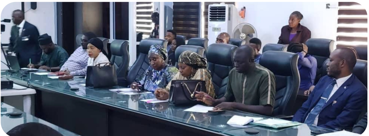
At the Federal Ministry of Health press briefing