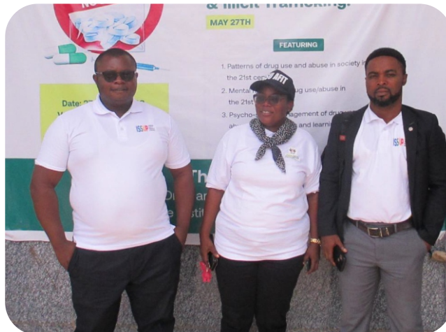
ISSUP Kaduna Members @ Air Force Institute of Technology, Kaduna, for 2023 International Day against Drug Abuse and Illicit Trafficking