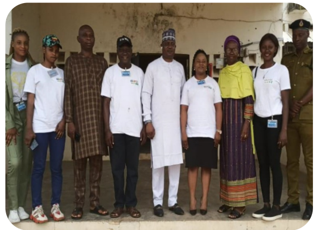
During the courtesy call