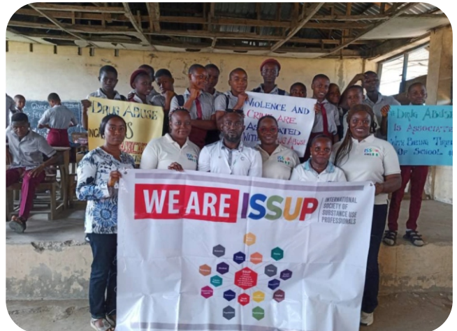
Government Secondary School Lagos Street