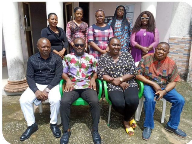
Courtesy call to CRS NANNM