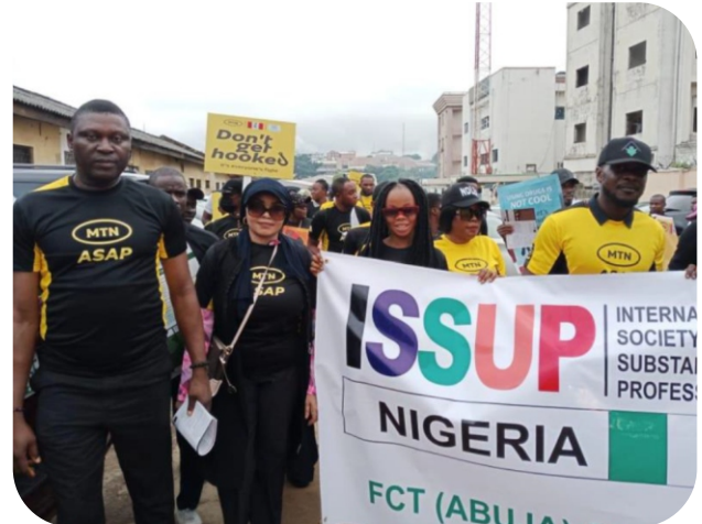
During the anti-drug walk in Abuja