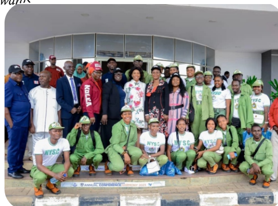
Some of the participants at the grand finale