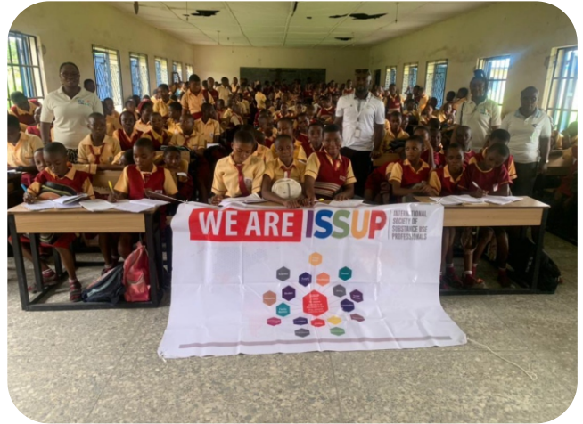
Government Secondary School Henshaw Town