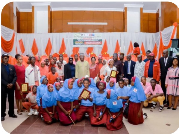
Secondary school students at the grand finale with their awards