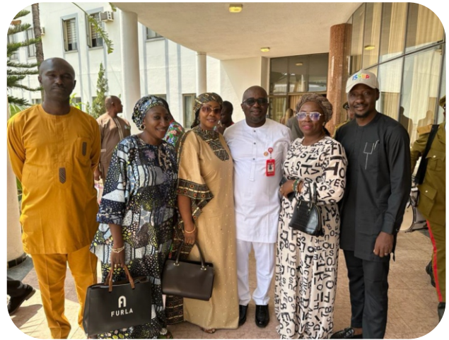
ISSUP, NDLEA and NSCDC officers at the state House Conference Center Abuja