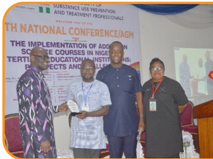
Rewarding best performing state coordinators for 2023, Lagos and Cross River State Coordinators